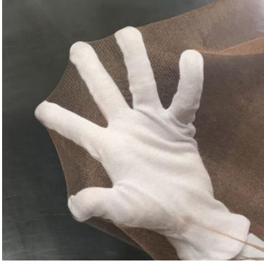
New metal mesh (c) Taiyo Wire Cloth